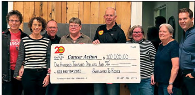
Sunflowers to Roses presented their largest donation to celebrate their 20th Anniversary, $100,000 from their annual Bike Ride!

Cancer Action has continued to stand in the gap. We are a critical support for cancer patients and