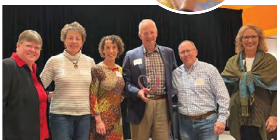
Sunflowers to Roses recognized for their 20th Anniversary and support to Cancer Action